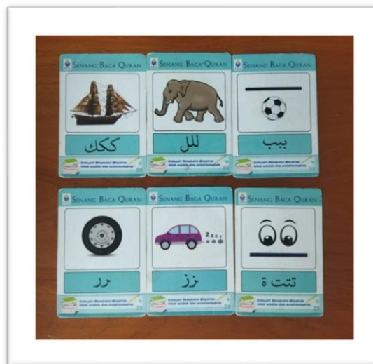
Figure 2. Card Media with Hijaiyah Letters