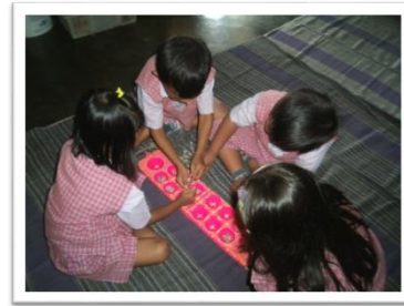
Picture 1. Children are playing 'congklak'

The 'congklak' game illustration performed in this study is illustrated in the documentation below: