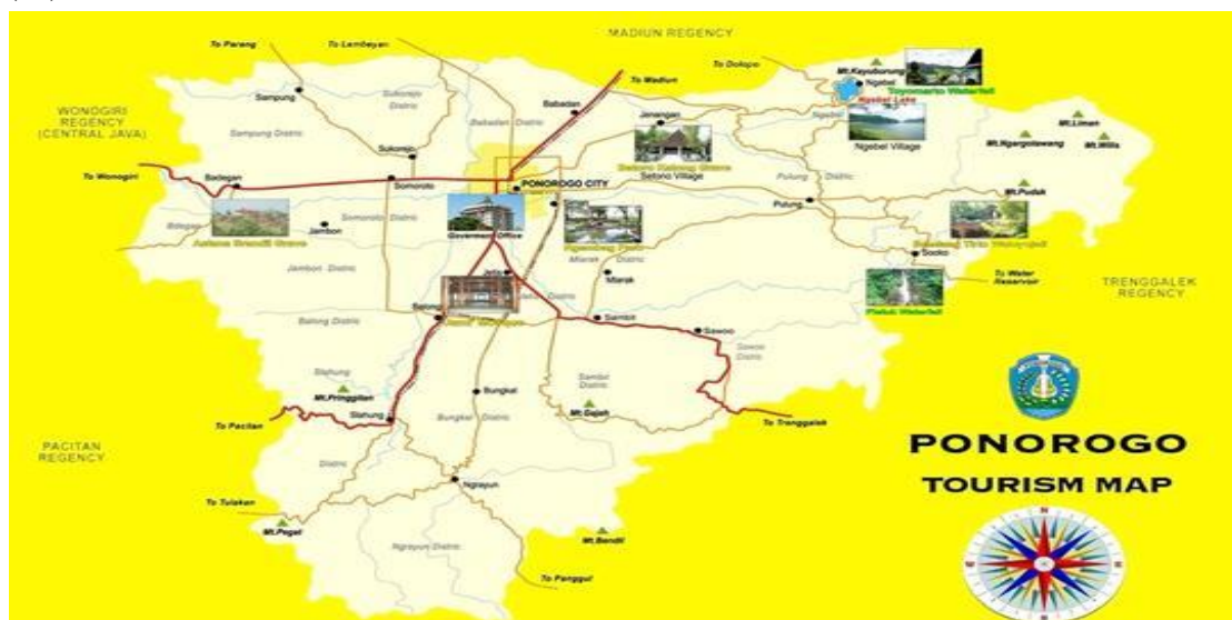
Figure 1. Map of Destination in Ponorogo Regency

Ponorogo District has potential in tourism field with a total of eighty-four (84) natural tourist sites, twenty-nine (29) human-made tourism sites, seventy-two (72) religious tourism sites, and thirty-four (34) cultural tourism sites.