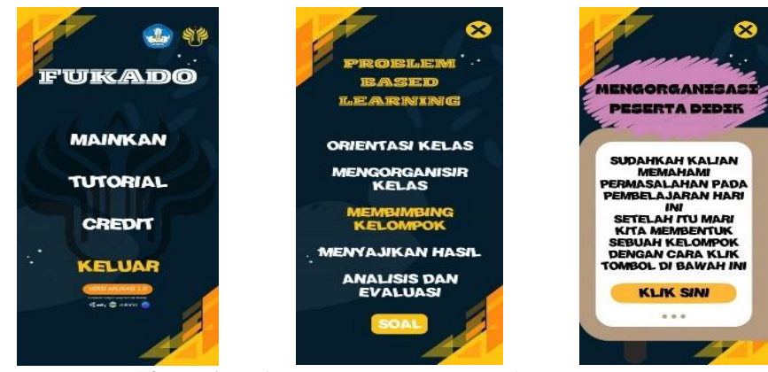
Figure 1. Main menu, syntax menu, and syntax menu 2

In designing a learning media using Canva as a media design tool and unity as a tool in developing a media so that the display can be interactive and can be used in learning. The media design is described as follows.